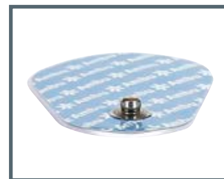
S= Stainless steel Stud